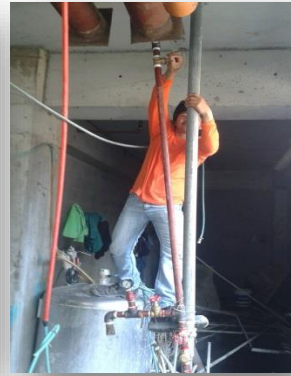
4. Fire Protection Line