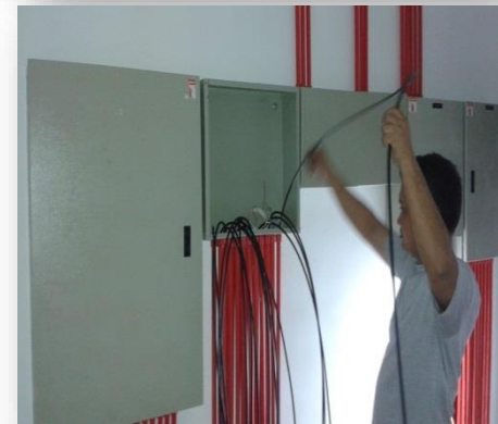
4F to 15F Meter Center & Wiring Installation at Electrical Room