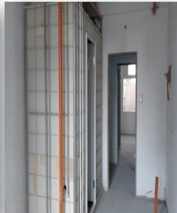
g Fire Protection, ITC and Auxiliary Drain Line