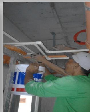
2. Sanitary Line