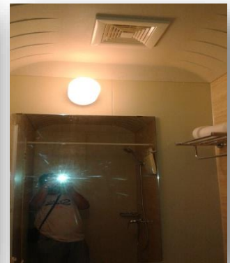
Modular Toilet Lighting