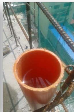
3. Air Con Drain Line