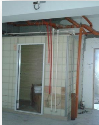
9F Room Electrical Installation