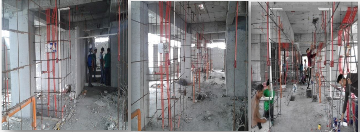
26F Electrical Roughing-ins