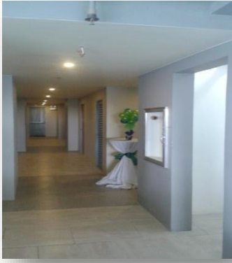
4F Hallway Lightings