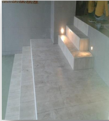
Swimming Pool Lightings