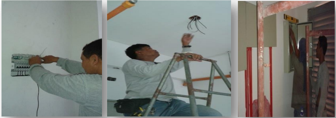
4th floor to 15th Floor - Circuit Breaker & Wire Installation at Rooms